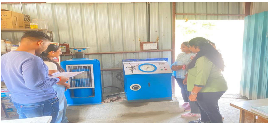
Fig. No. 1 Cube testing result on Compression Testing Machine

The quantity of cubes tested included standard cubes and a combination of sawdust and micro-silica with 10% and 15% replacement. The testing was conducted at 3 days, 7 days, and 28 days intervals. A total of 27 cubes were tested in this study. Various quality tests on concrete, such as compressive strength tests, slump tests, permeability tests, etc., are used to ensure the concrete's quality for a given specification. This concrete quality testing provides an idea of concrete properties such as strength, durability, air content, permeability, etc